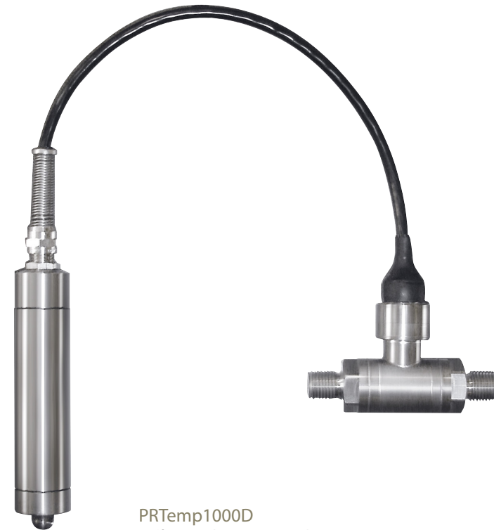
PRTemp1000D Differential Pressure and Temperature Data Logger