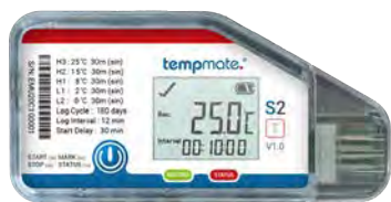
Main Technical Specifications tempmate.®-S2 T