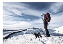
PETS, FARM ANIMALS