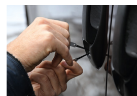
ANTI-THEFT & BACKUP SOLUTION