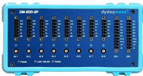
dydaqmeas with 8 analogue inputs, digital I/O and a powerful ARM® CPU

Each dydaqmeas data acquisition system is also a powerful edge computer with an integrated web server. All functions can be set up and managed via the modern web interface in a browser. The measured data can be displayed on individually designed dashboards in a web browser worldwide.