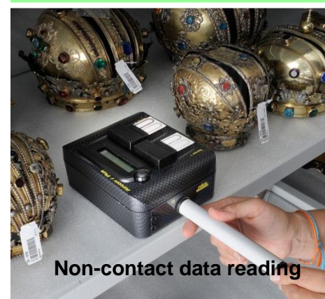
Non-contact data reading