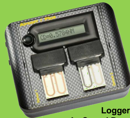
Logger AIRCORR I PLUS