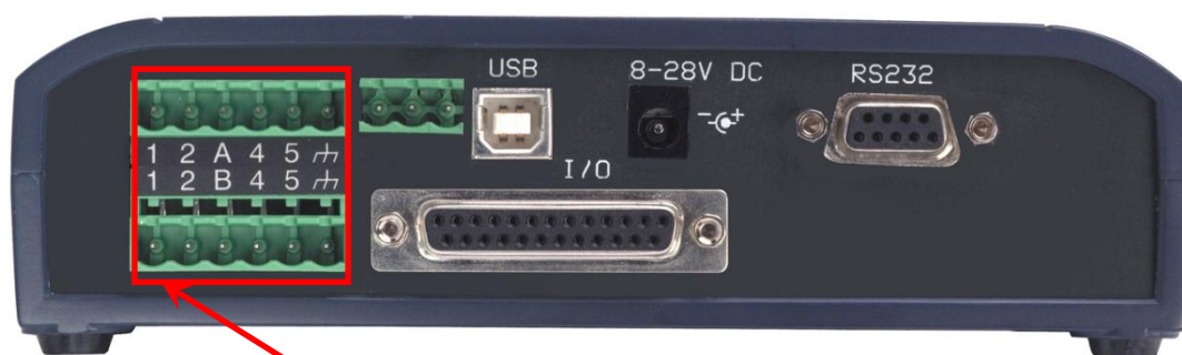
Input blocks A and B